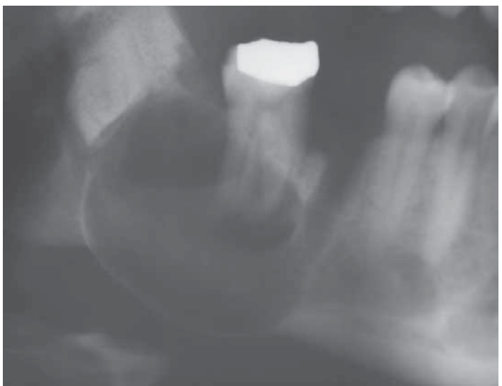
Figure 2 . Post-operative view demonstrating undisplaced retained roots of ectopic lower third molar with evidence of bony access distal to LR7 to facilitate coronectomy.

lower right face. Clinical examination demonstrated retained roots, as charted, but also bony expansion in the right posterior mandibular region. No other associated symptoms or signs were noted. An orthopantomogram revealed an ectopic lower right third molar with an associated well demarcated unilocular radiolucency suggestive of a cystic lesion. The lesion appeared to extend anteriorly to the lower right first molar region, distally up into the ascending ramus of the mandible, with associated bony expansion at the inferior margin of the mandible (Figure 1). A close association of the ectopic third molar with the inferior dental canal was noted, so too were radiolucent areas indicative of thin or absent bone both buccally and lingually. A keratocyst or odontogenic tumour could not be ruled out at this stage.