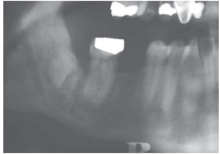
Figure 3 . Post-operative review radiograph at 13 months demonstrating good bony healing and migration of retained roots antero-superiorly away from the inferior dental canal.