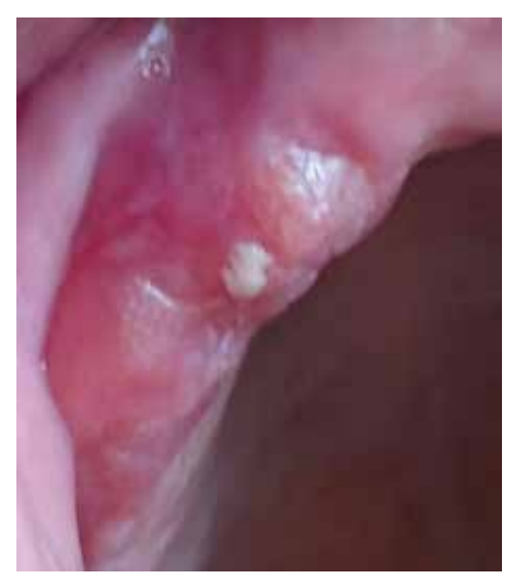
Figure 5. This speckled lesion with no evidence of dysplastic change was under review for several years. The vigilant patient noticed a change in the way the lesion felt. A repeat biopsy of the area was performed based on previous clinical photographs and the patient's concern. Interestingly, after two separate biopsies, there was no evidence of dysplastic change.

Figure 4. Removal of this lower lip lump required access via the lower labial mucosa. The mental nerve runs superficially within these tissues, and the risk of damage is reduced through blunt dissection of the tissues.