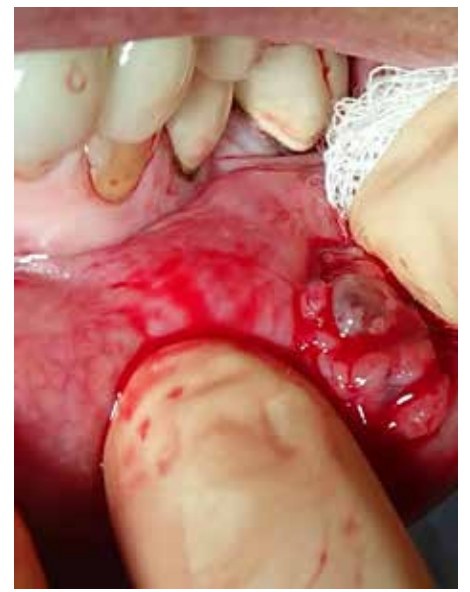
Figure 4. Removal of this lower lip lump required access via the lower labial mucosa. The mental nerve runs superficially within these tissues, and the risk of damage is reduced through blunt dissection of the tissues.