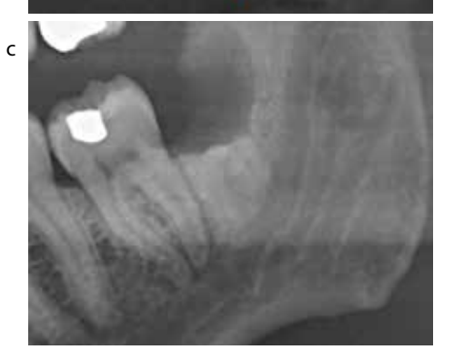
Figure 6. (a) This patient experienced recurrent episodes of pericoronitits from his lower left third molar. The pre-operative OPG demonstrated darkening over the root and a curvature of the distal root. (b) CBCT imaging was ordered demonstrating a curve in the distal root, loss of cortication of the inferior dental canal and minor narrowing (red arrow). A decision was made with the patient to perform a coronectomy of the LL8. (c) A post-operative radiograph taken after 2 months demonstrating the roots in situ . The patient maintained normal sensation of his lower lip and chin.

been a change in the appearance of the lesion (Figure 5).