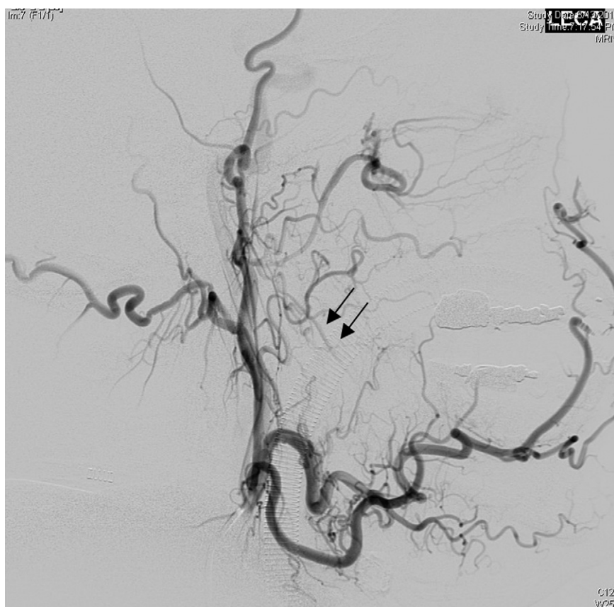
FIGURE 3. Left external carotid angiogram (with digital subtraction angiography), lateral view, showing stagnation of flow in the left inferior alveolar artery (arrows).

Wasson, Ghodke, and Dillon. Hemorrhage After Third Molar Extraction. J Oral Maxillofac Surg 2012.