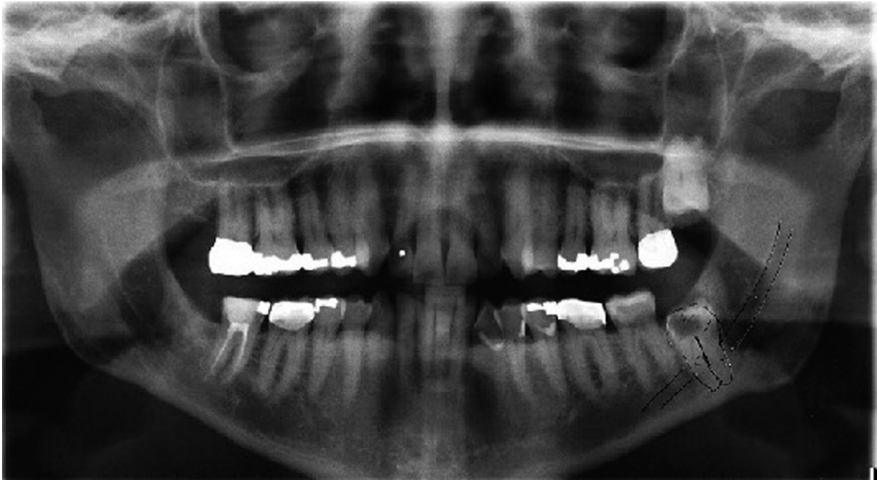
FIGURE 1. Panoramic radiograph displaying a vertically oriented and carious impacted mandibular left third molar.

Wasson, Ghodke, and Dillon. Hemorrhage After Third Molar Extraction. J Oral Maxillofac Surg 2012.